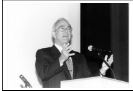
Governor Paul E. Patton