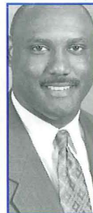
George Nichols III Commissioner Kentucky Department of Insurance