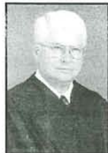
Walter Baker Attorney, Former Kentucky Supreme Court Justice, and Former Member of the General Assembly

Led by journalist Bill Goodman and filmed by KET during the conference, a panel of Kentucky leaders considers the Commonwealth's fiscal future . . . from the vantage points of current and former state and local government officials, private sector leaders, and advocates for the public interest.